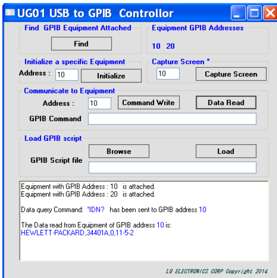
Fig. 1 UG01 Control Panel

If you plug an UG01 USB-GPIB Controller on your computer, you will see the Icon as shown in Fig.1 when you run UG01.exe.